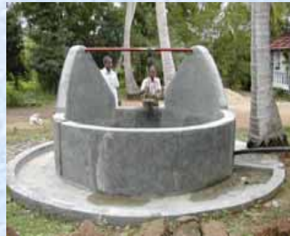
5) Shallow well