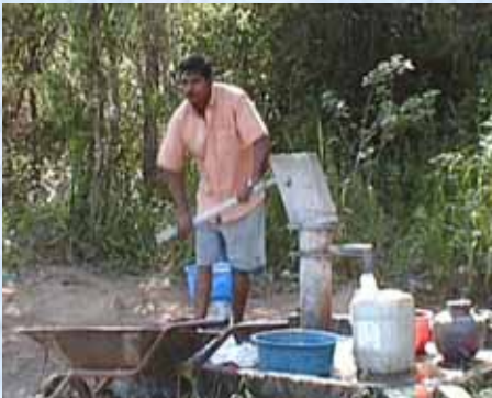
4) Hand pump