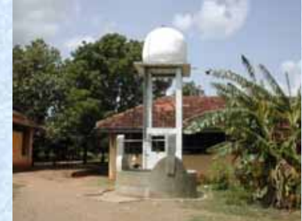
3) Low cost storage tank