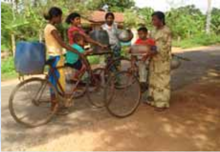
1 Community collect Water from rivers before the project