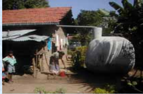
2 Rain water harvesting