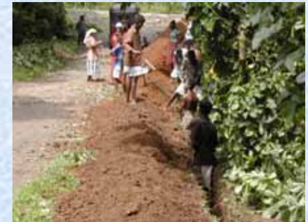
6) Community pipe laying